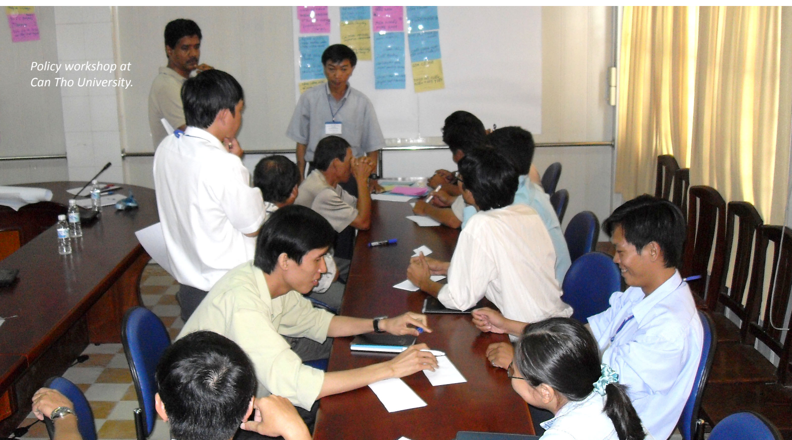
Policy workshop at Can Tho University.