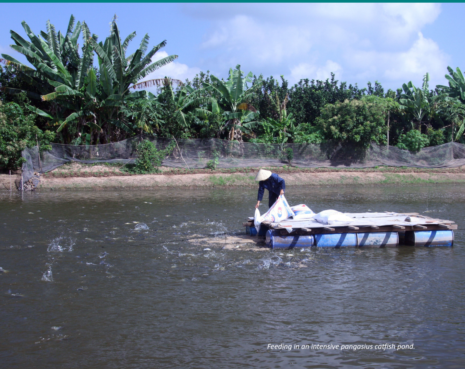
Feeding in an intensive pangasius catfish pond.