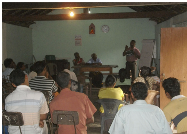
Stakeholder consultative workshops in Batticaloa.

Identify different technologies that can be employed by CBF fishers to increase the culture period. These technologies can be made available for selected farmers as a pilot project to study the feasibility and opportunities that they provide in enhancing the culture period. One such approach will be to keep the fish fingerlings in cages until spilling of reservoir is over. Fixing a barrier net across