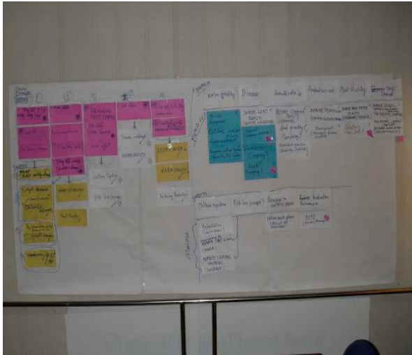
Fig. 4 Mapping stakeholder perceptions

The Department of Agriculture and Rural Development in Can Tho is currently organizing 20 SQF 1000 training workshops to catfish farmers training courses in 2009