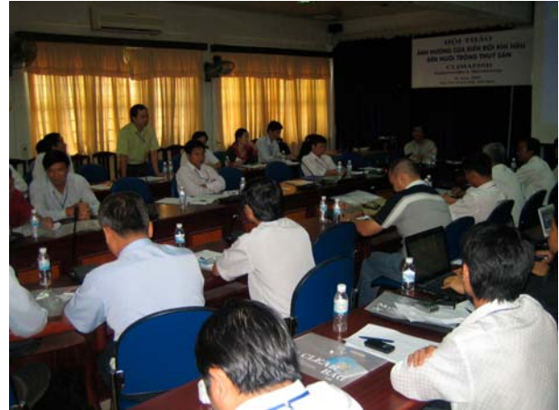
Fig. 1 Plenary session at the workshop

"Stakeholder analysis can be defined as an approach for understanding a system by identifying the key actors or stakeholders in the system, and assessing their respective interest in that system" (Grimble et al. 1995, pp. 3-4). The importance of stakeholder analysis in understanding the complexity and compatibility problems between objectives and stakeholders was emphasized by Grimble and Wellard (1996). According to Pretty et.al. (1995) and Chambers (1997) stakeholder analysis is closely associated with participatory approaches and is often seen as a tool for effective management of natural resources through stakeholder participation.