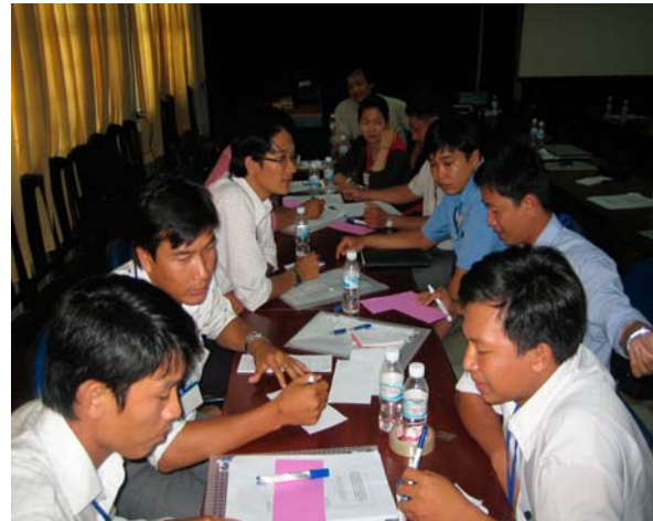
Fig. 2 Participants in group discussions

ranked by stakeholders based on the importance and severity (Figure 3). The stakeholders later identified the most relevant agencies that should be responsible for implementing the measures and the time scale (Figure 4).