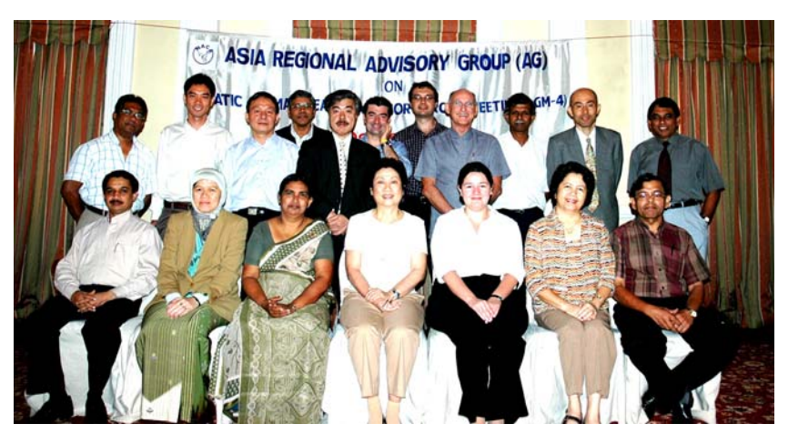
Participants in the Advisory Group meeting.

The fourth meeting of the Asia Regional Advisory Group (AG) on Aquatic Animal Health (AGM-4) was held at Hotel Taj Samudra, Colombo, Sri Lanka on 22-24 October 2005 in conjunction with the 6<sup>th</sup> symposium on Diseases in Asian Aquaculture. The meeting, attended by ten Advisory Group and six co-opted members, addressed key aquatic animal health issues in Asia, including the regional quarterly aquatic animal disease reporting system; the spread of emerging aquatic animal diseases in the region; implementation of the Asia Regional Technical Guidelines on Health Management and the Responsible Movement of Live Aquatic Animals; operation of the three-tier regional resource base for health; and ways to further strengthen regional and international cooperation in Asian aquatic animal health management. The AG, constituted by the NACA Governing Council in 2001, in cooperation with OIE and FAO, has been providing advice to Asian governments and NACA on aquatic animal health management matters in the region. Some of the key points discussed and recommendations made are summarized below.