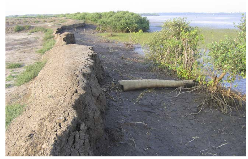
Flood damage to ponds in Dhabharevu. Ponds without the protection of a mangrove buffer suffered severe damage. Areas protected by mangrove faired much better (note the lesser damage to the dyke in the background).

The reason for the slow growth during the last crop in Sri Subramaneswara Aquaclub, Serepalem and the Kota area is suspected to be due to the eutrophication of the water supply in Uchinta. The ammonia level in this canal during the last crop was almost 1ppm and the pH was more than 9. One of the big paper mills releases its effluent to the upper part of this canal and many paddy fields also drain water into it. There has been a lot of siltation in the canal and the water flow during