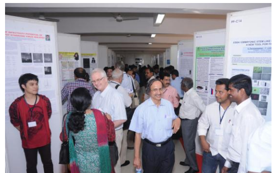
The poster sessions are equally well attended