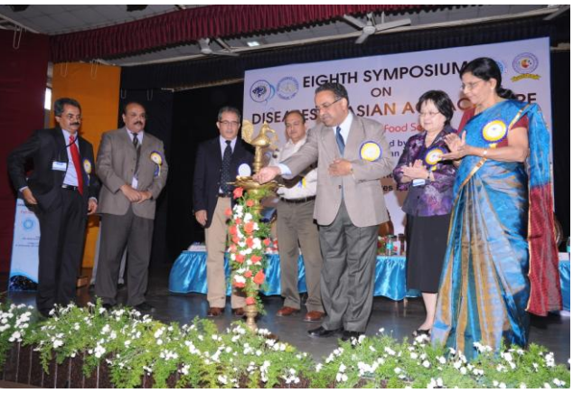
A blessing ceremony at the DAA8 opening

116 scientists from 22 countries and a total of 200 local fish health scientists, not counting the hundreds of post