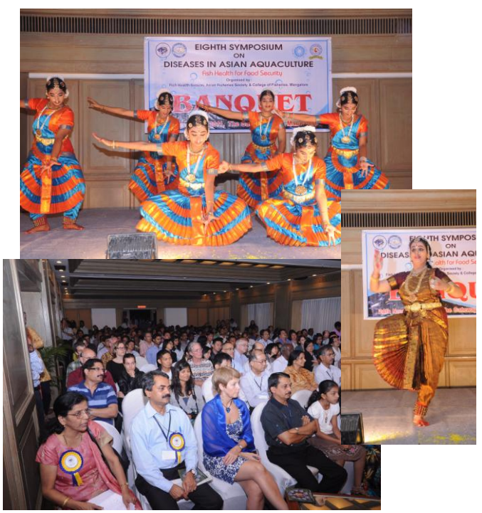
A tale told by the teacher and her group of students at the DAA8 banquet night to a captivated audience.