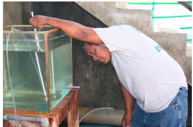
Picture 11: Cleaning of wastes and sunken eggs from holding facilities