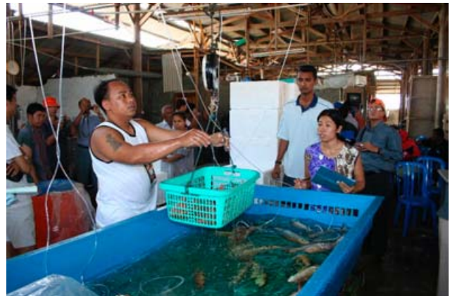
Picture 67: Exporter weighing grouper species for air transport, Bali