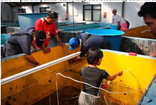
Picture 23: Participating in larvae tank cleaning with local students

Some participants conducted cleaning activities at the training hatchery unit. The cleaning activities include tank bottom cleaning and siphoning, and post-harvest larvae tank cleaning. Picture 23 to 24 show participants carrying out cleaning activities.