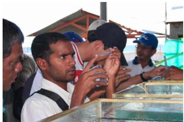
Picture 13: Participants checking the counting eggs and checking quality