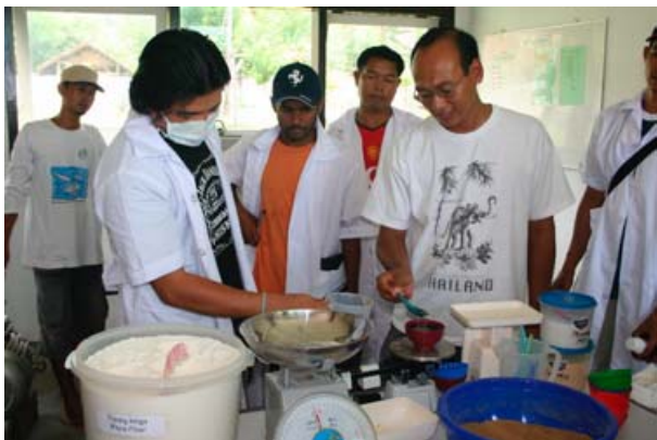
Picture 40: Preparation of feed ingredients for grouper artificial feed

A full process artificial feed production was conducted for the training course. Four feed formulae were given and participants were shown how to measure and mix raw materials and produce pellet with small low cost machinery. After production the feed were spread for oven-drying. Picture 40 to Picture 44 show the feed making activities.