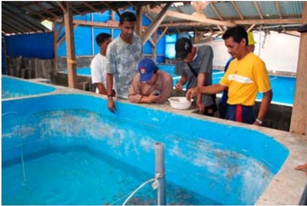
Picture 64: Field trip to medium-scale grouper hatchery in Gondol area