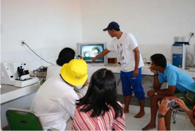
Picture 14: Explaining to participants about good and poor quality eggs under microscope via colour TV