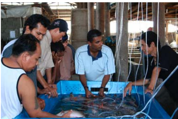
Picture 68: The owner and staff of the export company explaining to participants the activities in the company