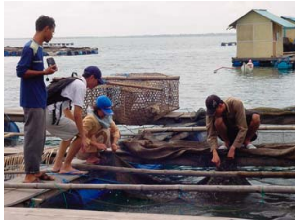
Picture 52: Participants checking fish in the cage during a field trip