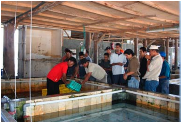
Picture 66: Harvesting of grouper species for shipment to Hong Kong by air