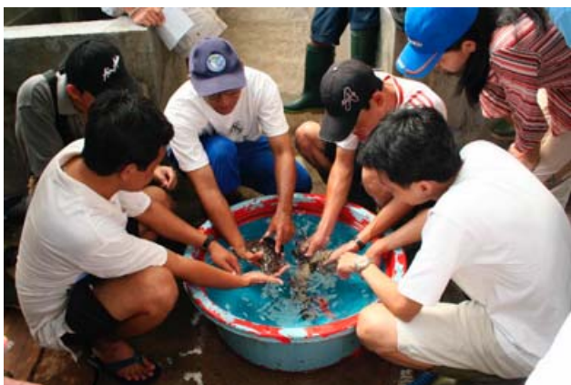
Picture 6: Freshwater bath of Cromileptes altivelis for parasite treatment