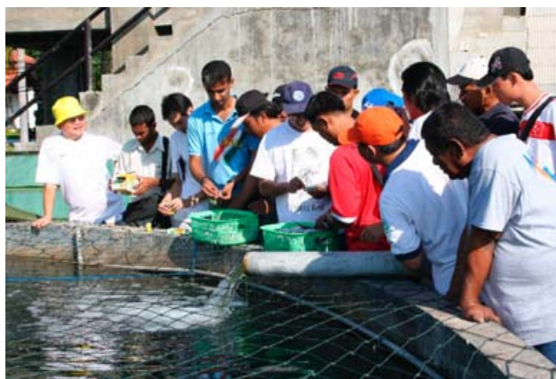
Picture 5: Vitamin enrichment for grouper broodstock feed and feeding activity