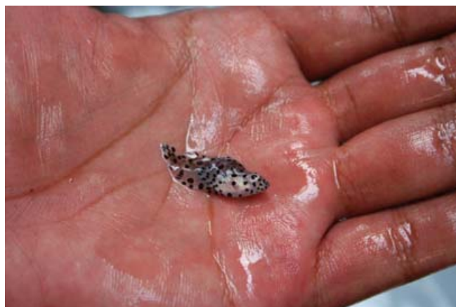
Picture 31: Deformed C. altivelis grouper fingerlings are identified removed during grading activities