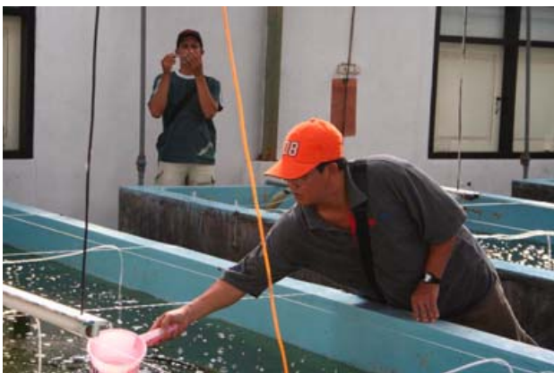
Picture 21: Feeding live feed to grouper larvae by Vietnamese participant