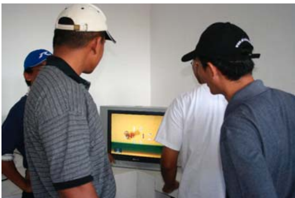
Picture 47: Showing how rotifer look like under microscope via colour TV