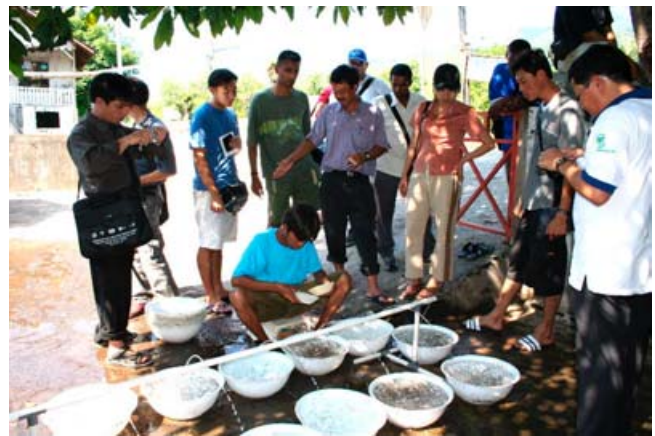
Picture 55: Observing a grading activities during a visit to small-scale grouper hatchery