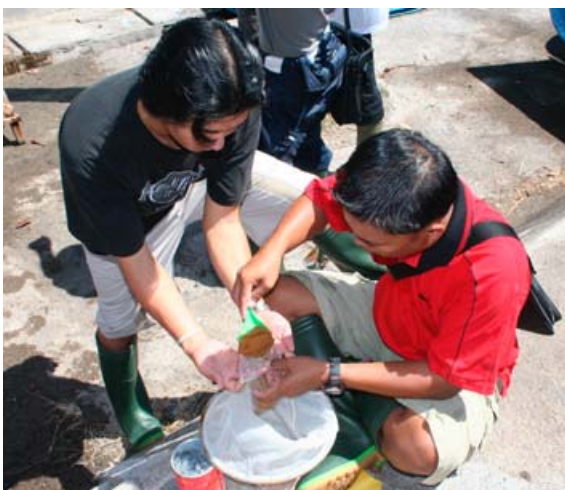
Picture 29: Harvesting and packing of decapsulated artemia cytes for storage