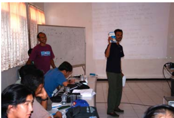
Picture 48: Small-scale hatchery own come to share his experience with participants

A special session at the training course was organized for the participants which allow them to gain first hand hatchery experiences and stories with the farmers. Two farmers who operate grouper hatcheries were invited and they gave presentation at the class room and sharing their experiences and knowledge with the participants.