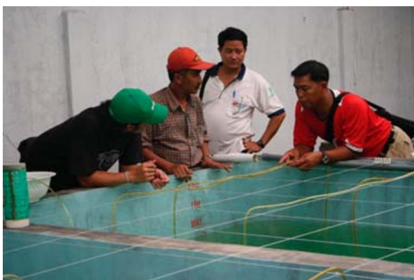
Picture 53: Explaining how small-scale grouper hatchery operate by trainer in a small-scale hatchery field trip

There were several field trips arranged for the training course. The field trips included two location, Situbondo and Bali. A total of 4 field trips were organized in Situbondo. The field trips in Situbondo including visits small-scale (5), medium-scale (1) and large-scale (2) grouper hatcheries which produce E. coioides , E. fucoguttatus , and C. altivelis fingerlings. Visits to floating cage farms farming grouper species were also organized.