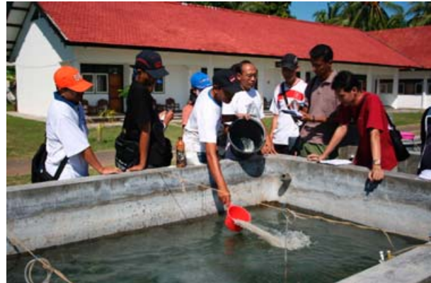
Picture 46: Preparation of fertilizers for outdoor microalgae production