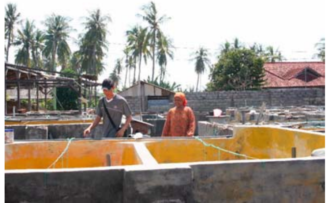
Picture 65: Small-scale backyard hatchery for milkfish in Gondol area