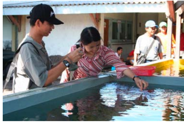
Picture 59: Feeding tiger grouper fingerlings during a field trip visit to a large-scale grouper hatchery