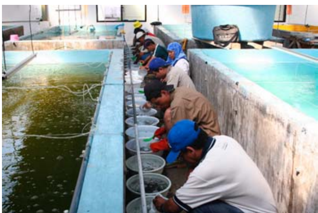
Picture 32: Participants grading grouper larvae based sizes and quality