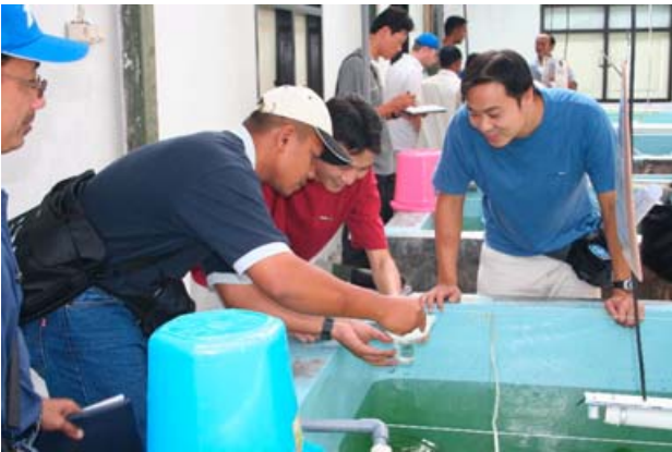
Picture 15: Collecting larvae sample for observation under microscope

Several practical components were arranged for larviculture and hatchery management section of the training course, including feeding, larvae tanks cleaning, observing larvae condition, microscope observation of eggs and larvae development, etc. Picture 15 to Picture 22 show some of the practical activities carried out.