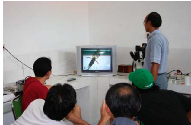
Picture 16: Showing grouper larva (below D 20) to under microscope via colour TV