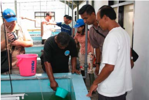
Picture 19: Feeding of live food to grouper larvae under trainer guideline