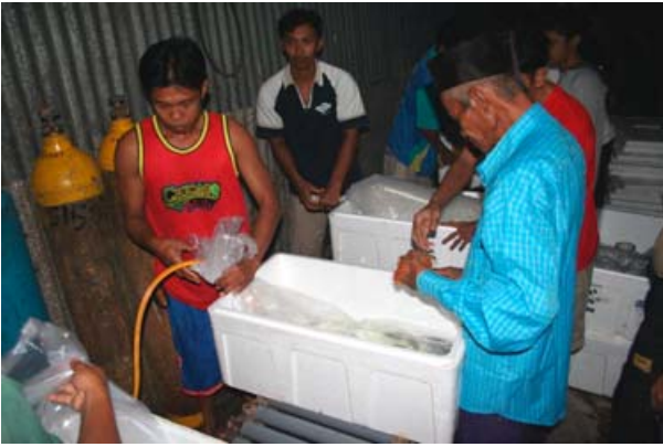
Picture 58: Field trip to backyard hatchery during harvesting and packaging at night for transport by air