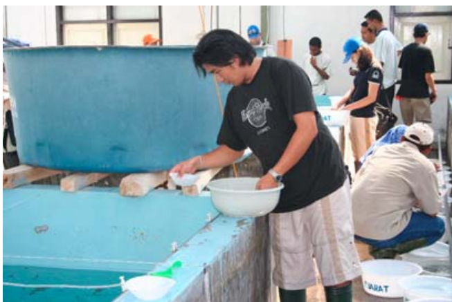
Picture 34: Grading of C. altivelis fingerlings and separate the big from small and also remove deformed fingerlings