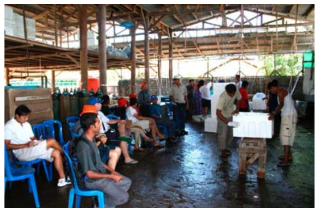
Picture 69: The full process of the packaging of live groupers for air shipment to Hong Kong was demonstrated to participants