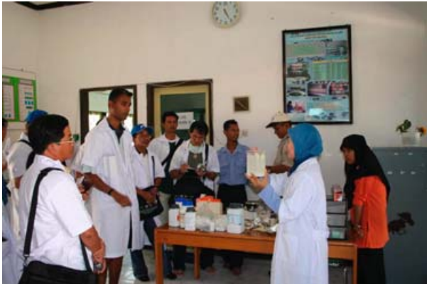
Picture 45: Explaining of various nutrients for microalgae production

Participants were also shown the procedures to prepare fertilizers and batch culture of algae before transfer to outdoor large volume culture. Outdoor culture and condition were explained. Picture 45 to Picture 47 show the feed making activities.