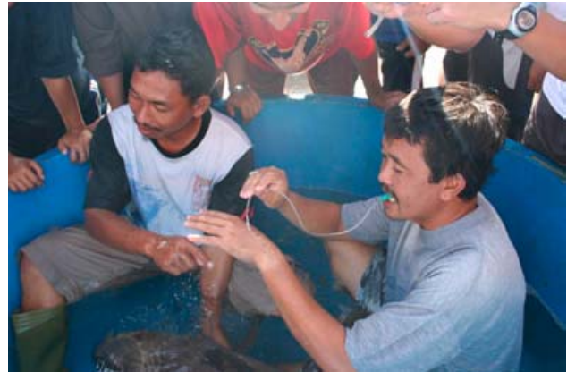
Picture 9: Trainer and technician showing the sperm collected from giant grouper broodstock