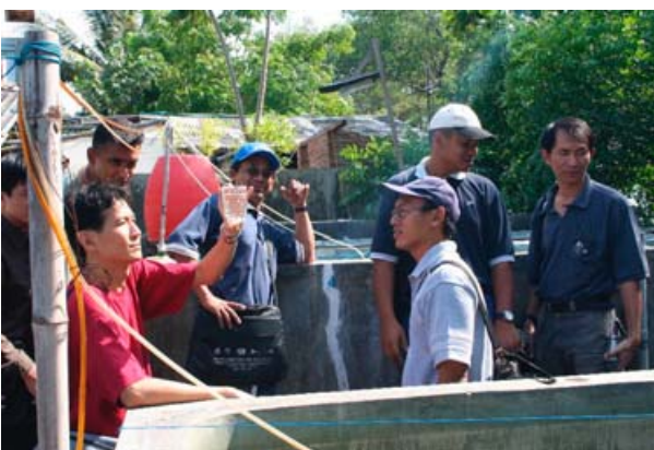
Picture 56: Visit to small-scale grouper hatchery and looking at the rotifer culture section