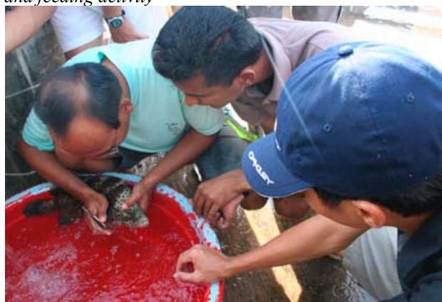
Picture 7: Checking of C. altivelis broodstock for external parasite