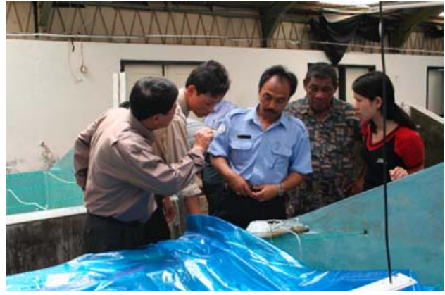
Picture 2: The Director of BADC-Situbondo explaining the hatchery system during facility tour