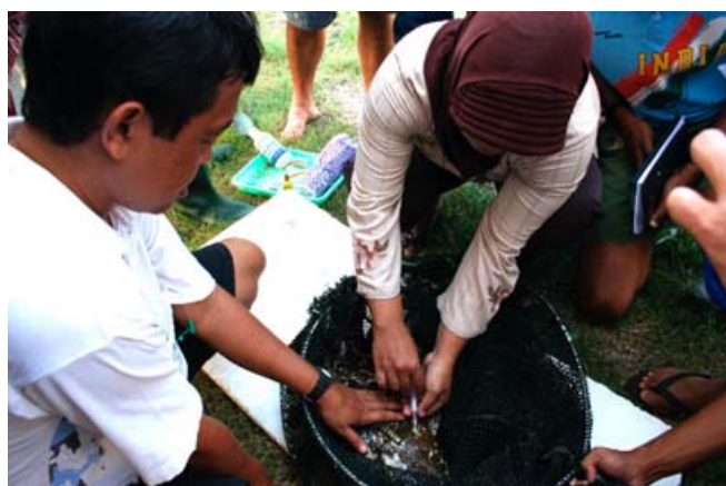
Picture 33: Fish health specialist is showing how to inject medication for tiger grouper broodstock