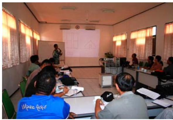
Picture 49: Another small-scale grouper hatchery owner come to share his experience