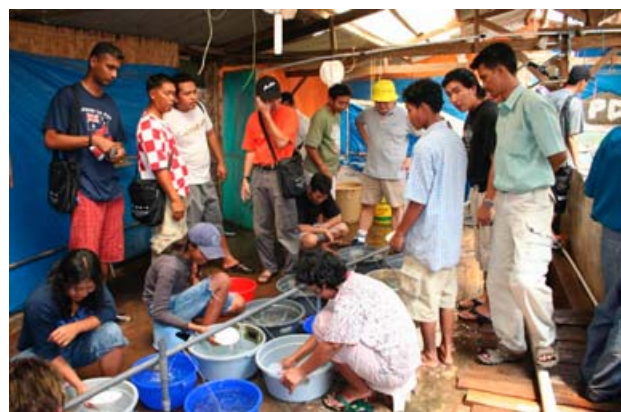
Picture 57: Harvesting and grading activities at a small-scale hatchery