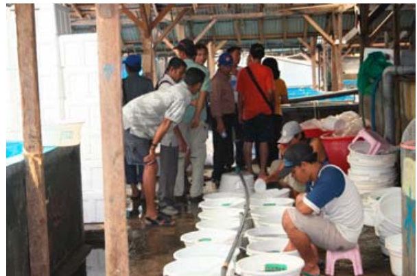
Picture 63: Observing grading activities in medium-scale grouper hatchery