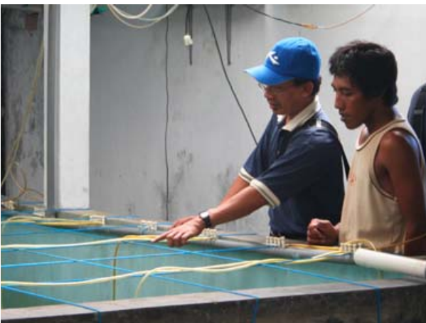
Picture 54: Malaysian participant asking small-scale hatchery technician about the situation in the larvae tank