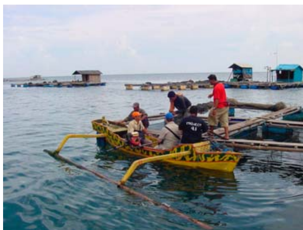
Picture 51: Traditional fishing boat for field trip to floating cage farms growing