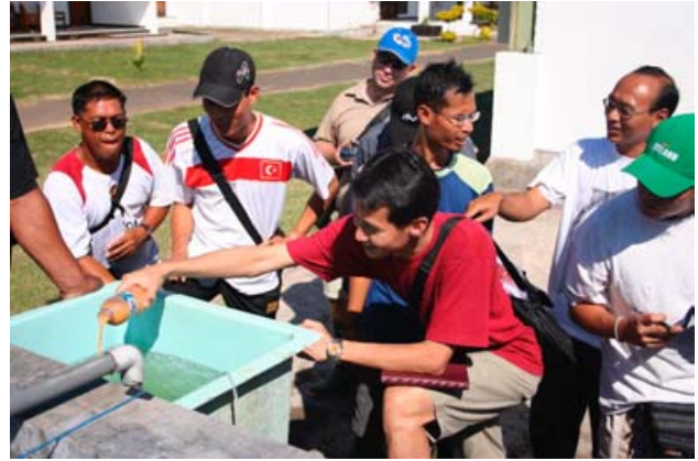
Picture 26: Putting enrichment material into rotifer enrichment tank