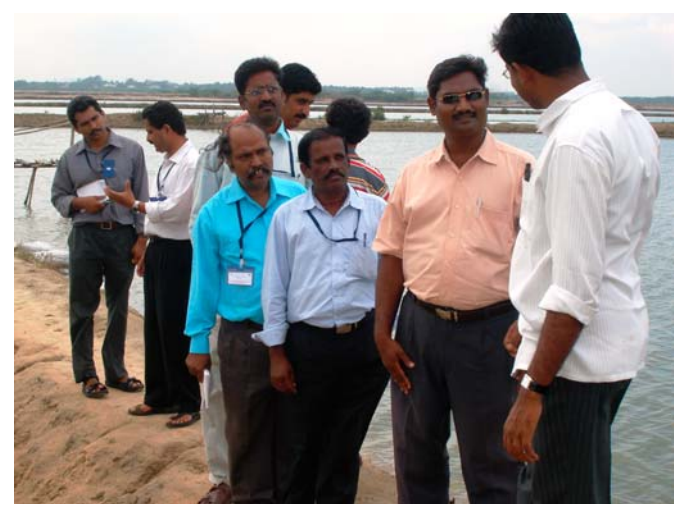
Training at a shrimp farm.