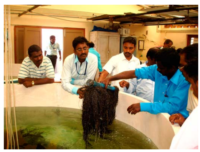
Training at a crab hatchery.

Those who wish to participate in the training course dealing with entrepreneurship development in coastal brackishwater aquaculture may contact the Director, Central Institute of Brackishwater Aquaculture (ICAR), 75, Santhome High Road, R.A. Puram, Chennai-600028, India through e-mail to: director@ciba.res.in.