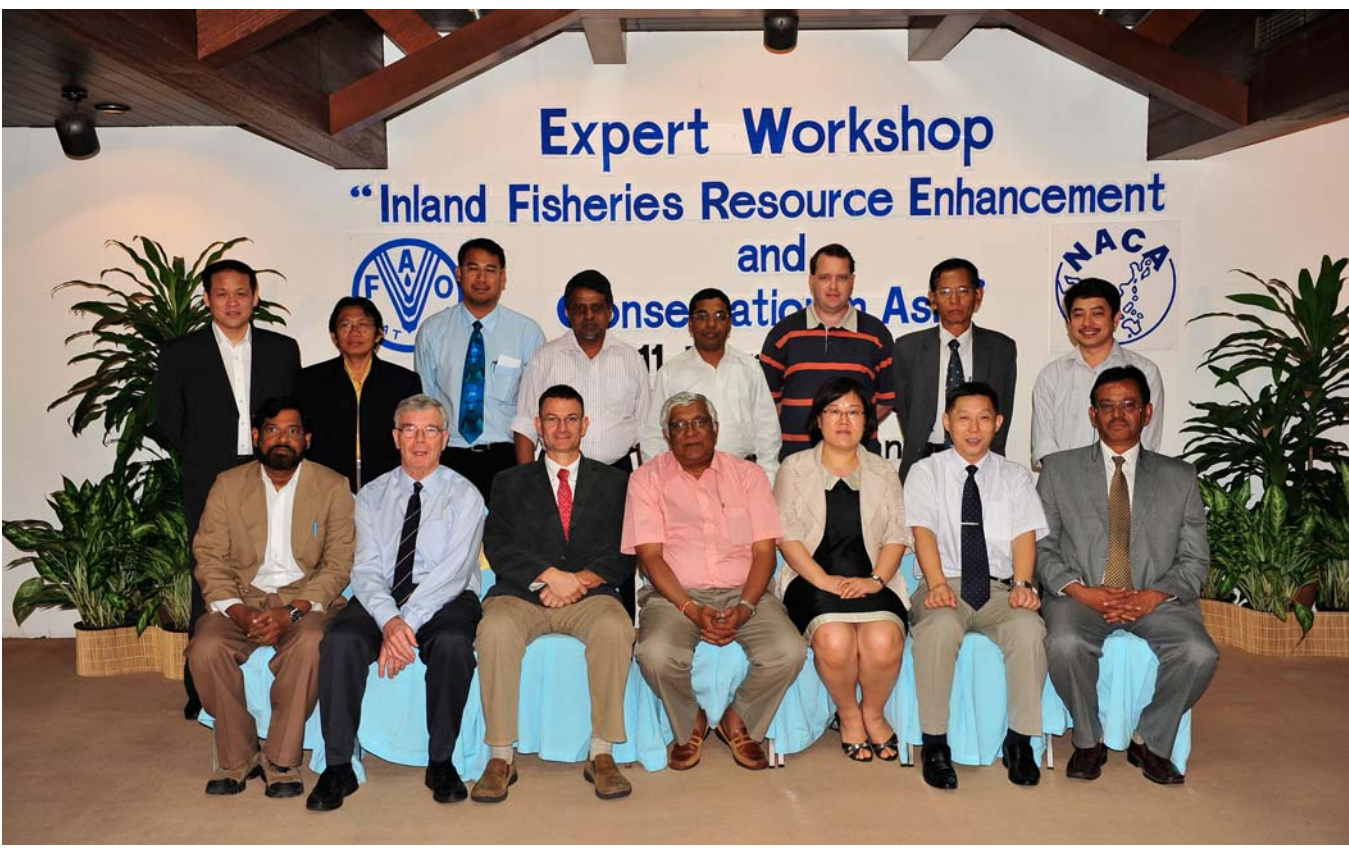
Participants in the workshop at Pattaya, Thailand.

Over the past few decades inland fisheries resources have come under increasing pressure from water engineering projects, pollution and overfishing. This has lead to an alarming decline in the natural populations of many important inland fish species in Asian countries, with implications for the economic welfare and nutrition of millions of people that are dependant on these resources, for the environment, and also for the aquaculture industry that depends on the genetic resource base.