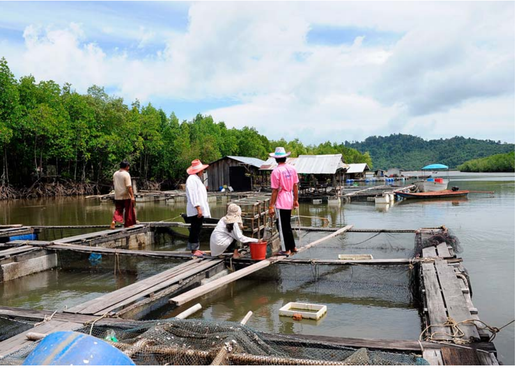
Small-scale cages in Phang-nga canal, Thailand.

Marine fish cage culture in Indonesia is carried out in many areas as there are several well sheltered bays and water quality is generally good compared to other countries in Asia. Cage culture can be found throughout Indonesia, including the islands of Sumatra, Bangka, Bengkulu, Lampung, Kepulauan, Seribu, Banten, Java, Lombok, Kalimantan and Sulawesi. Most cage farms in Lampung are relatively medium and large-scale operations (80-120 cages) and well constructed with wooden walkways, often shaded, house (accommodating 6-10 workers) and equipped with electricity, freshwater supply and high-pressure pumps for net cleaning. Fish are held in net cages typically 4-18 months depending on the size of the cultured species. There have been a few commercial pellet feeds (such as Comfeed, Matahari, Cargil, CP, etc.) developed for marine fish culture with the price around US$ 1.0-1.2/kg but the results are still not economically profitable and generally not well accepted by the farmers. In most parts of Indonesia trash fish / low valued fish is sourced through fish traps and or small-scale gill net around cage farming areas and these are still readily available at a relatively low price (US$ 0.1-0.2/kg) and in a fresh condition. In other areas or during storm season, the price of trash fish of the same quality may rise up to US$ 0.3-0.5/kg. In general, in Indonesia, the sourcing of trash fish / low valued fish for mariculture operations provides many thousands of jobs.