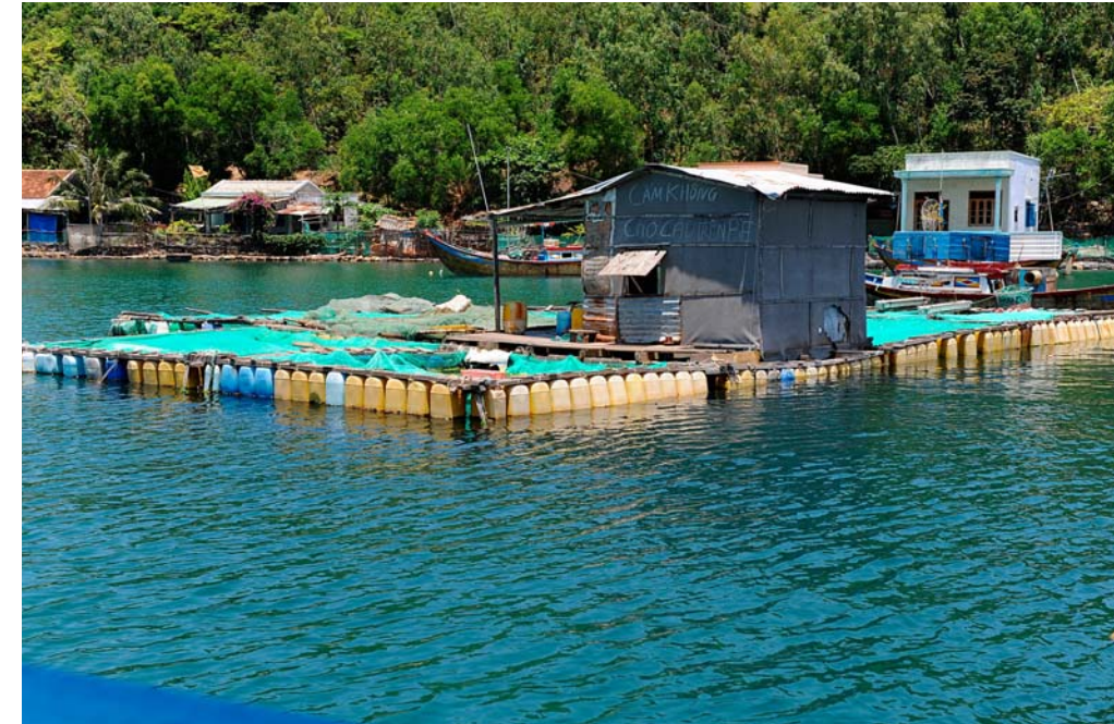
Small-scale cages in Nha Trang, central Viet Nam.

In Thailand, seabass market is mainly live and chilled forms for local consumption and is exported to Singapore and Malaysia by land but live grouper is mainly exported only by air to Hong Kong, Taiwan Province of China and mainland China. Export species include orange spotted grouper, tiger grouper and leopard coral trout. However, Hong Kong considers Thai grouper as low grade product (pale color and muddy taste) due to their culture in low saline water or mangrove creeks. Shipment by air also burdens the cost for Thai exporters as they cannot compete with fish transported