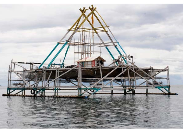
A stationary trash fish trap, a traditional method of fishing, in Lampung, Indonesia. In Lampung Bay these are fairly common, and in the recent years these have been further modified and made mobile in a manner similar to purse seine operation dragged by two boats.

Over 125 marine finfish hatcheries are now operating in Bali, Lampung and East Java. These hatcheries have the capability to switch to species depending on market demand, such as in the case of milkfish and mouse grouper. However, still the culture of orange spotted grouper, Malabar grouper, dusky tail grouper ( E. bleekeri ), red snapper ( L. argentimaculatus ), rabbit fish ( Siganus spp.) is mostly dependent on wild seed stocks, collected in Sumatra, Java and Sulawesi.