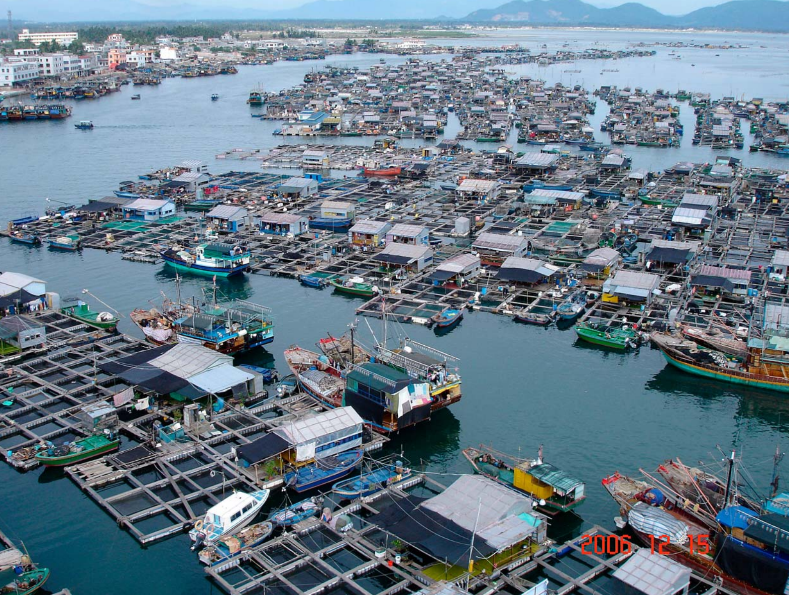
Inshore cages in Xe Cuan Bay, Hainan, China. Each raft with the living quarters is owned and managed by one family, and the main species cultured are grouper, pompano and cobia.

spots. Over 80% of marine cages are small-scale (4-20 cages) while the rest are medium-scale (20-100 cages). Large-scale cage culture is always limited by insufficient fingerling supplies, irregular demand of the domestic live fish market and unreliable export markets. Many small-scale farmers also use gill nets to trap small fish to feed their farmed stock in order to reduce costs.