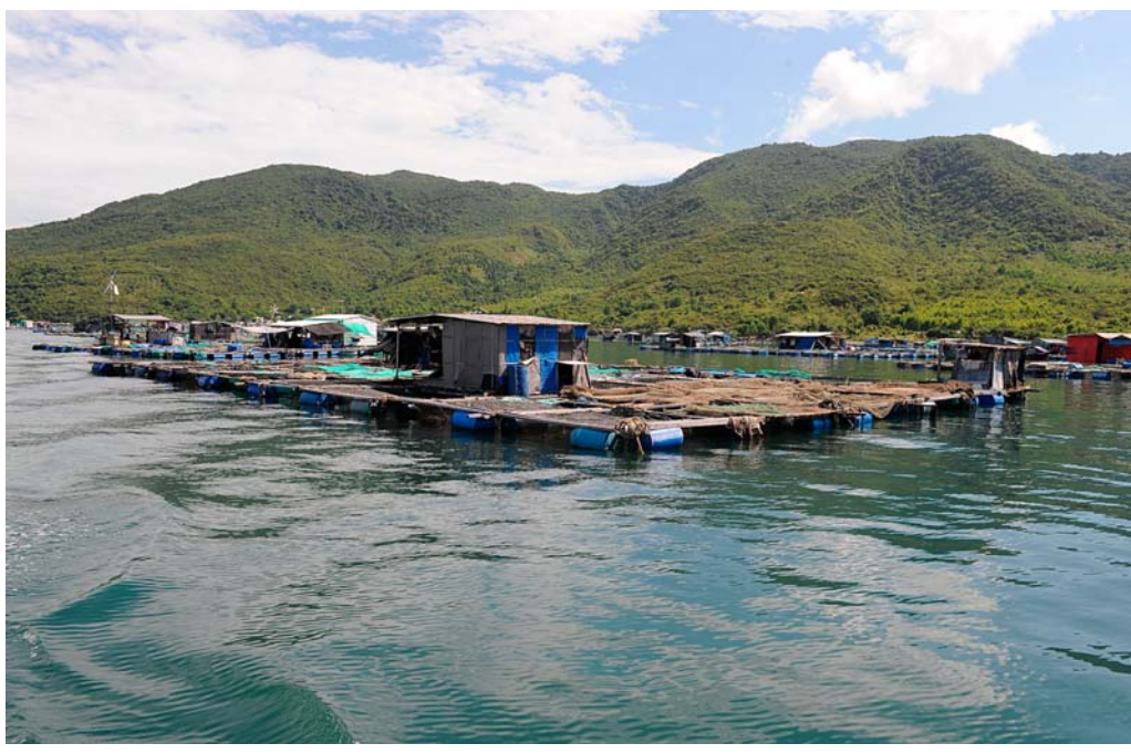
Medium-scale cages (40 to 80 cages operating at any one time) in Lampung, Indonesia.

There are a number of marine fish species widely cultured in cages such as mouse or humpback grouper ( Cromileptes altivelis ), tiger grouper, Asian seabass ( Lates calcarifer ), primarily driven by the commercial success in artificial breeding of such species in Lampung and Gondol (Bali) hatcheries, followed by uptake of the technologies by private