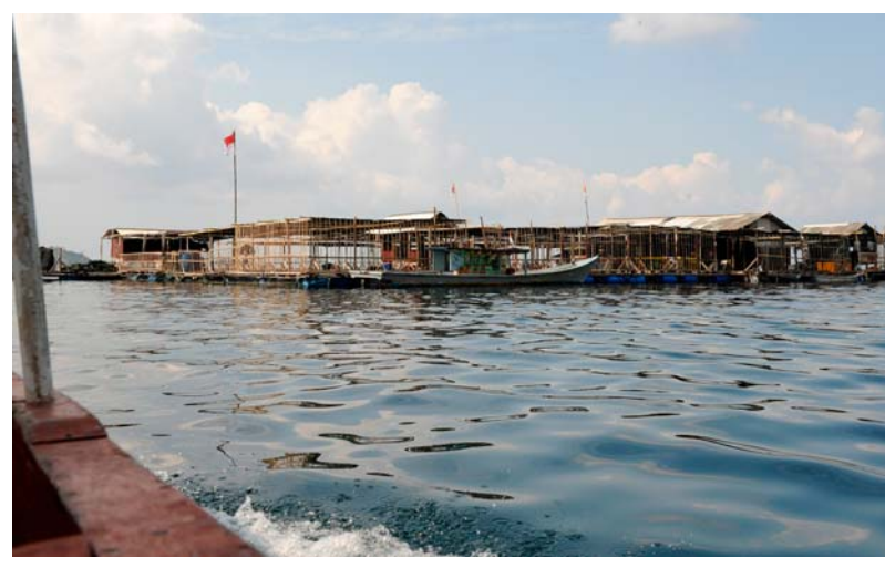
Large-scale cages (> 200 cages operating at a time), Lampung, Indonesia.