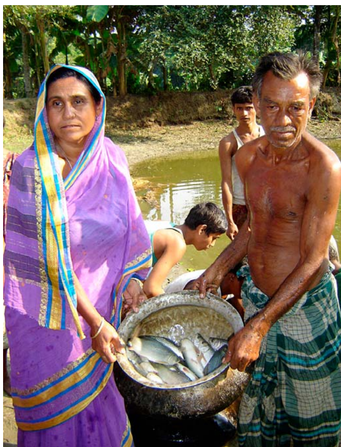
Working together in fish harvesting.