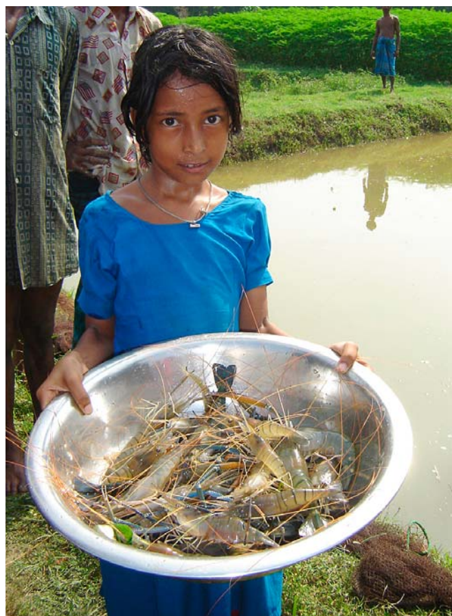
A girl with harvested fish - high value prawn (Macrobrachium rosenbergii).

In the study area, the women are involved in various facets of aquaculture activities, including stocking of ponds, feeding of fish, pond management, fertilisation, liming, and