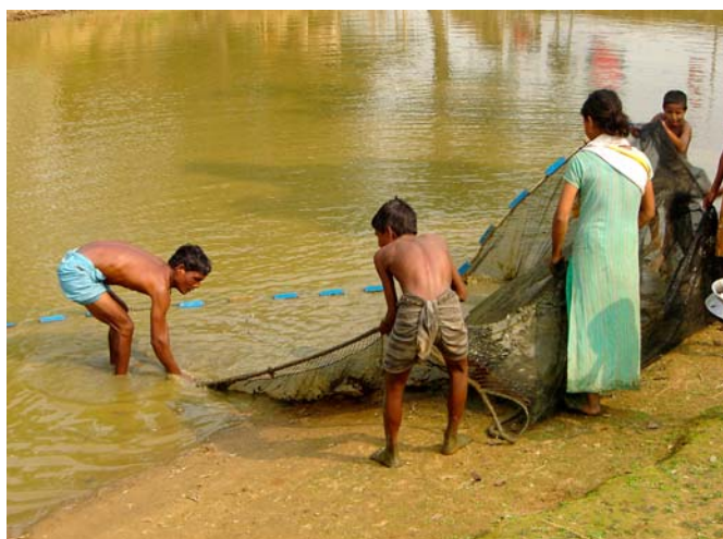
Helping with the harvesting.

July to December 2007. The participatory rural appraisal tool focus group discussion (FGD) was conducted with women farmers (i.e. farmers' wives). A total of 20 FGD sessions were conducted in Phulpur sub-district under Mymensingh district where each group consisted of 8 to 12 women (total 192) and the duration of each session was approximately two hours. FGD was used to solicit an overview of women's participation in small-scale aquaculture activities. Questionnaire interviews with women were preceded by preparation and testing of the questionnaire and training of enumerators. A total of 100 women were interviewed in their houses and/or farm sites. Women were selected through simple random sampling. Several visits were made to selected women for observation of aquaculture practices. The interviews, lasting about an hour, focused on their involvement in aquaculture activities, constraints and socioeconomic benefits. Cross-check interviews were conducted with 20 key informants, including district and sub-district fisheries officers, local leaders, school teachers, researchers, policymakers and relevant non-government organisation (NGO) workers for the validation of collected information. Data from questionnaire interviews were coded and entered into a database system using Microsoft Excel software for analysis using SPSS (Statistical Package for Social Science) to produce descriptive statistics.