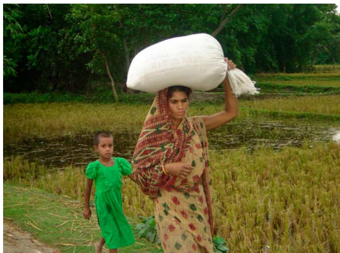
Carrying fish feed from the market.

A wide range of tools can be used for data collection to obtain a broad and in-depth understanding of women's participation in aquaculture. A combination of participatory, qualitative and quantitative methods were used for primary data collection (Figure 1). Data were collected for a period of six months from