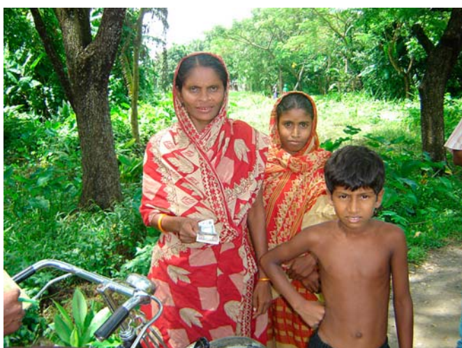
Aquaculture has improved economic power of rural women.