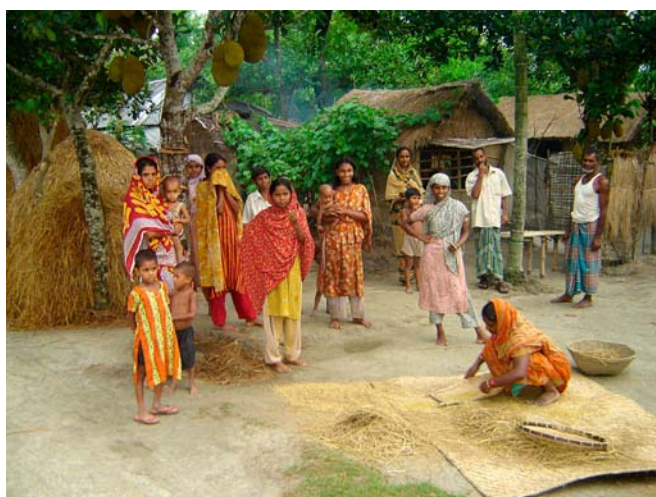
Rural women are typically involved many household works beside aquaculture.