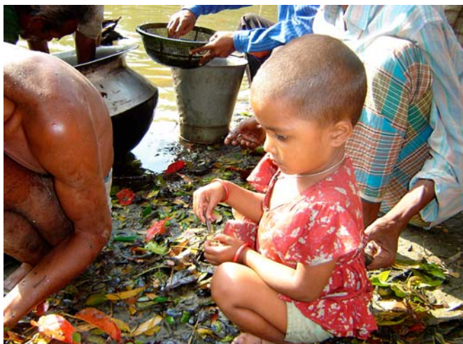
A baby girl sorting fish with her father (today's girl tomorrow's woman fish farmer).

fish harvesting and marketing. Based on a sample of 100 women farmers, it was found that women were involved in aquaculture activities with various degrees of participation (Table 1). According to the survey, the majority of women were regularly involved in feed preparation, feeding of fish, fertilisation, pond supervision and management, and fish harvesting. In general, women provide partial assistance to men in pond supervision and management, by applying feed,