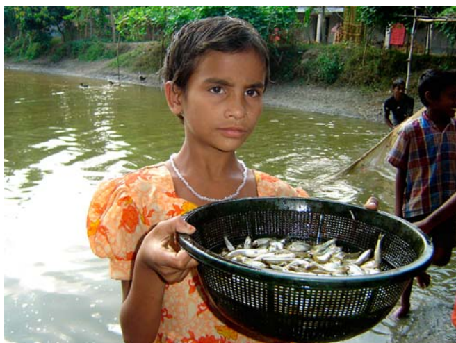
A girl with harvested vitamin-A enriched mola fish (Amblypharyngodon mola).