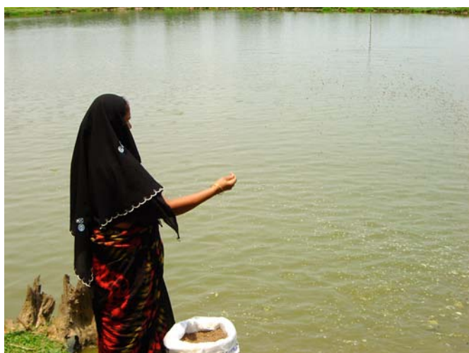
Feeding the fish.