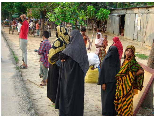
Women come forward to participate in development activities outside their homestead.

farming experience. Nevertheless, there is a negative association between family size and women involvement in aquaculture, valued at - 0.37, significant at the 10% level.