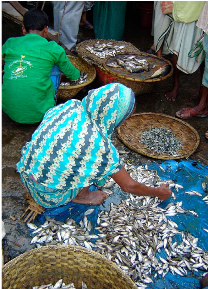
Trading fish at an urban market.

The empowerment of women could be the principal strategy to upgrade their status. The most effective ways of empowering rural women and enabling them to move out of poverty will depend on local economic, cultural and political conditions 6 . Moreover, women's empowerment depends on a