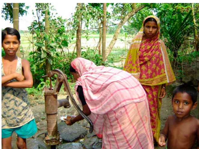
Aquaculture income has improved drinking water facilities.

lime and fertiliser. Most women reported that they managed the pond regularly in two ways: first, most routine operations such as fertilisation and feeding could easily be managed by women, and second, husbands were often busy in other work, away from the home for long hours, and hence the wife had to take the lead role in day-to-day operations. In several cases, harvest of fish for family consumption is done by women with the help of children. Husbands only help when they are at home or when the ponds water is too deep, requiring more specialised gear to be used for fish harvesting. Nevertheless, harvesting of fish for marketing is done by men with commercial harvesters. In that case, women are involved in post-harvest handling including sorting, grading and washing of fish.