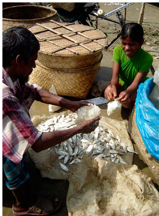
Icing of fish by a young girl.

According to the survey, fish production (an average 4,500 kg/ha/year) has increased 10-20% due to involvement of women. Job opportunities for women have increased since widespread of small-scale aquaculture in the Mymensingh area. The rapid development of the freshwater aquaculture industry has provided employment opportunities for women,