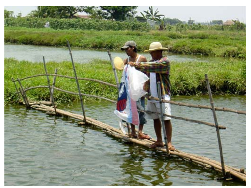
Feeding tilapia with commercial pelleted feed.

tilapia farming as their primary occupation with major secondary and other occupations being rice farming (21%), vegetable farming (12%) and livestock raising (12%) as well as driving, vending/trading, office employment and carpentry. Some 36% of tilapia farmers continued to grow rice in separate plots on their farm.