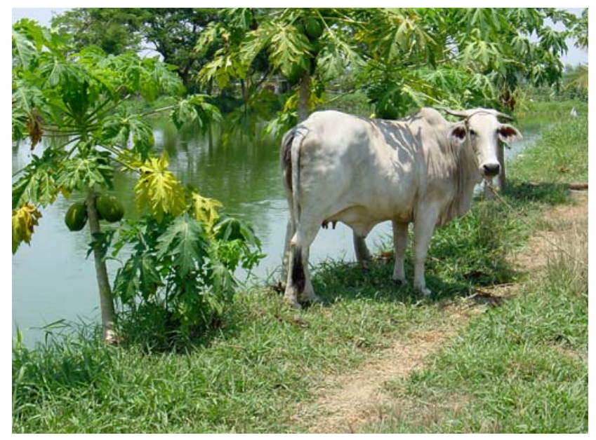
Papaya and cattle grazing grass on a pond dike on a multi-component farm.

Marketing tilapia was relatively easy for most farmers, most (77%) selling to wholesalers/assemblers with