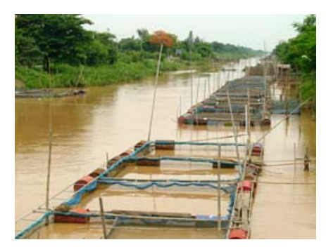
Red Tilapia Cages, Khlong 13, Pathum Thani Province.

CP initiated a form of contract farming, the first of its kind in Thailand for a freshwater fish, supplying fry and feed to franchised aquatic feed dealerships which oversaw the remainder of the production cycle. Dealerships nursed fry to stockable size, sold feed, and harvested and marketed fish when they attained 600g or more. This system proved attractive to potential market entrants as cage culture techniques were very simple to learn and feed dealerships provided initial technical support. The activity appeared predictable and relatively risk free for farmers because all fish over 600g were purchased at a set price upwards of Bt40($0.97)/kg. Dealerships offered