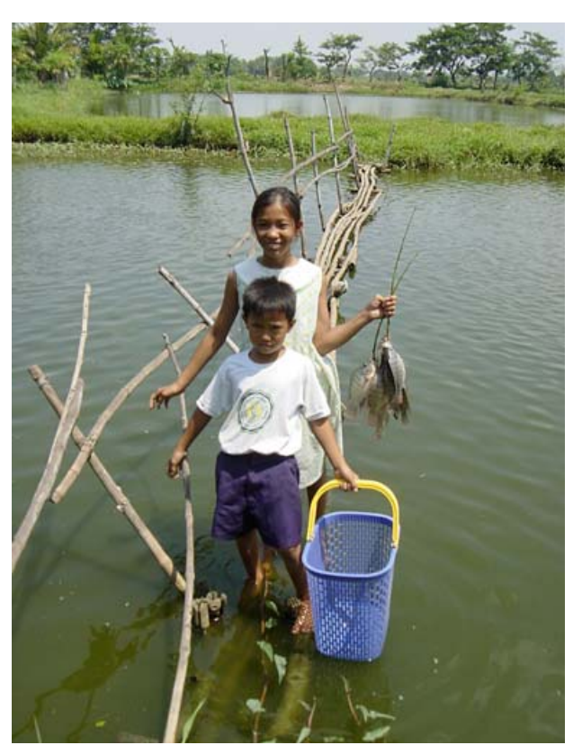
A farmers's daughter and son with tilapia caught for lunch.

the rest selling to retailers, consumers and brokers. Wholesalers/assemblers mainstreamed the harvests from the small-scale tilapia farmers live in aerated tanks to large consumer markets. This was facilitated by physical infrastructure such as roads, transport and communications.