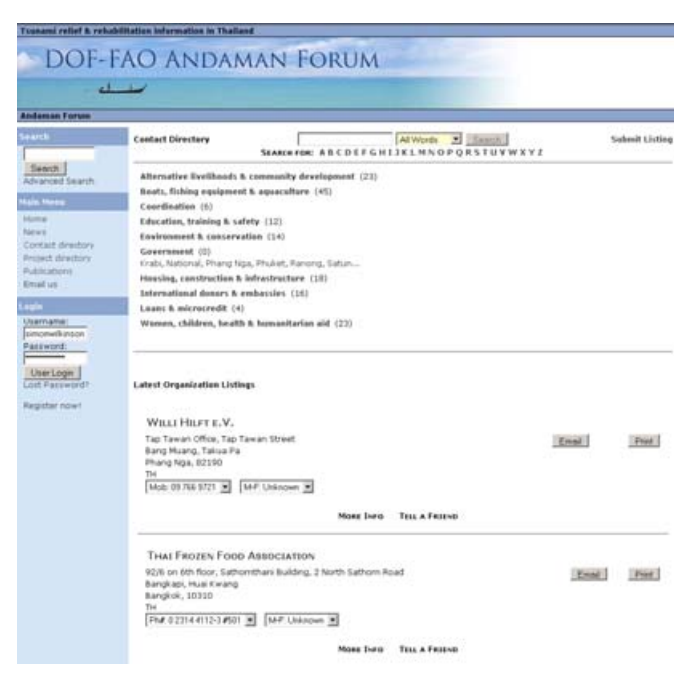
The contact directory lists donors & NGOs by category.

The home page lists the latest contacts, projects and reports.