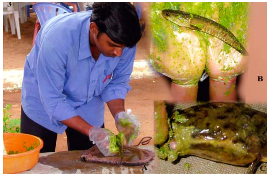
A&B: Topical application of neem paste to treat EUS-affected striped murrel. C: Neem paste being applied to xeropthalmia-affected spotted murrel.