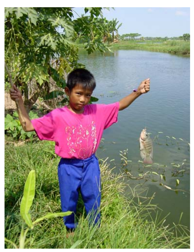
A farmers's son with a tilapia caught from a typical small-scale tilapia pond.