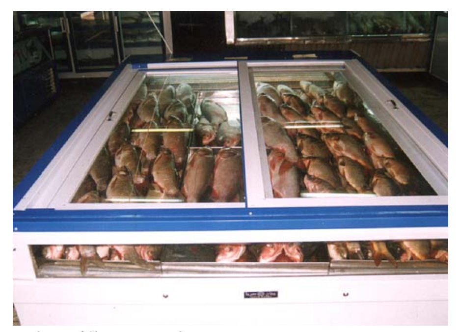
Marketing of Chinese carps, Tehran.