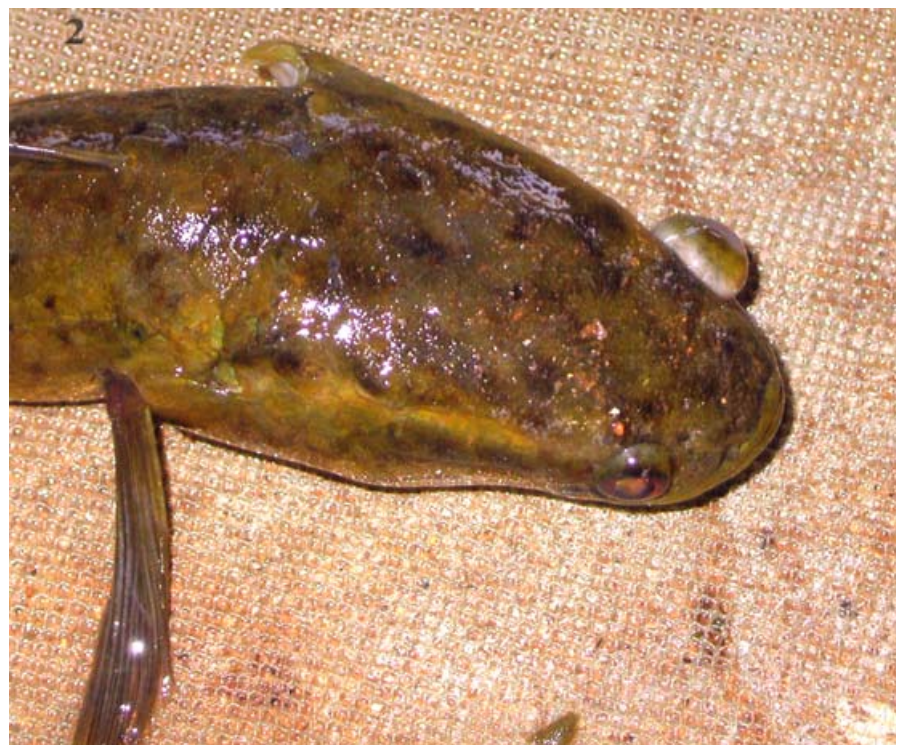
Xeropthalmia affected spotted murrel.