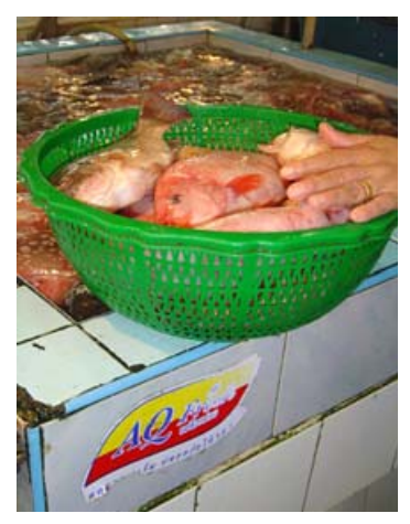
Live fish are kept in aerated tanks prior to sale.

two years however, and it is no longer common practice for feed dealerships to guarantee prices in advance, suggesting that the expansion of cage culture may have peaked.