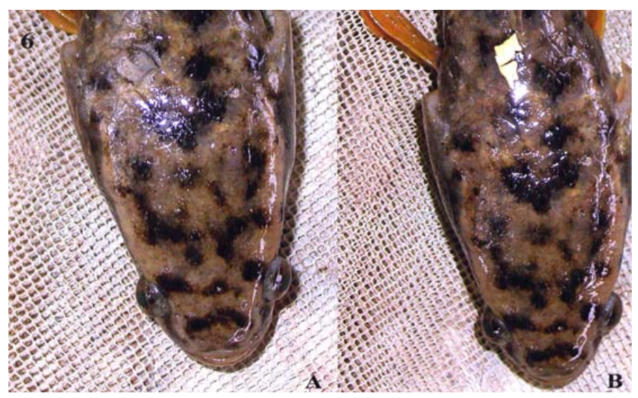
A: Partial recovery of xeropthalmia on third day of treatment. B: Complete recovery of xeropthalmia on sixth day of treatment.