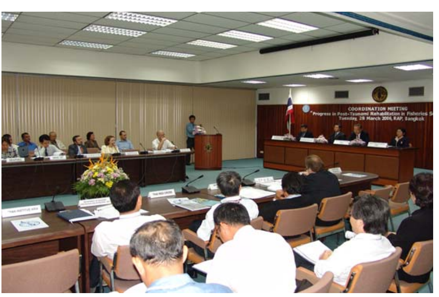
Opening of the coordination meeting on progress in post-tsunami rehabilitation of the fisheries sector.

Work on the projects began starting with the fisheries sector, which was by far the most heavily damaged with heavy losses throughout the six affected provinces of Thailand. Work later expanded to cover the agriculture sector (inclusive of fisheries, forestry and livestock) in Phang Nga and Ranong Provinces, which suffered the majority (>80%) of agricultural losses.