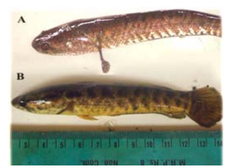
Complete recovery from EUS in striped murrel (A) and spotted murrel (B).

neem paste treated individuals complete wound healing was noticed on the 6th day of the treatment, whereas aloe paste treated murrels showed slower recovery and all the external wound disappeared on the 8th day of treatment. Diseased murrels with bulging eyes (xerophthalmia) showed recovery on the 3rd day after neem paste treatment and eye became normal on the 6th day, whereas aloe paste treated xerophthalmic C. punctatus became normal only on the 8th day.