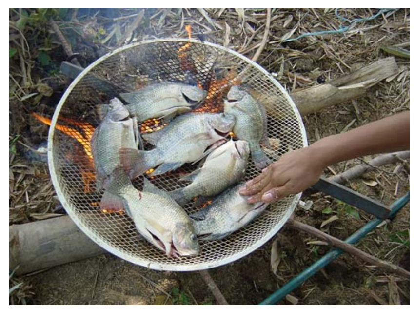
Tilapia broiled over a fire for lunch.

Tilapia pond farming is a profitable livelihood that contributes to reducing poverty in Central Luzon, but obstacles to entry must first be overcome. Access to livelihood assets, together with robust markets (input, output and labour markets), available services, facilities and infrastructure, and supportive policies and institutions are vital channels of effects for poverty reduction.