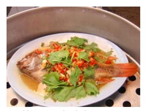
Freshly prepared red tilapia, Rangsit Market, Pathum Thani.

Red tilapia has been available for culture in Thailand since the mid-1980s when the Department of fisheries (DOF) developed a strain at the Ubon Fisheries Station. The fish performed well and there was considerable interest in its commercial potential but market-