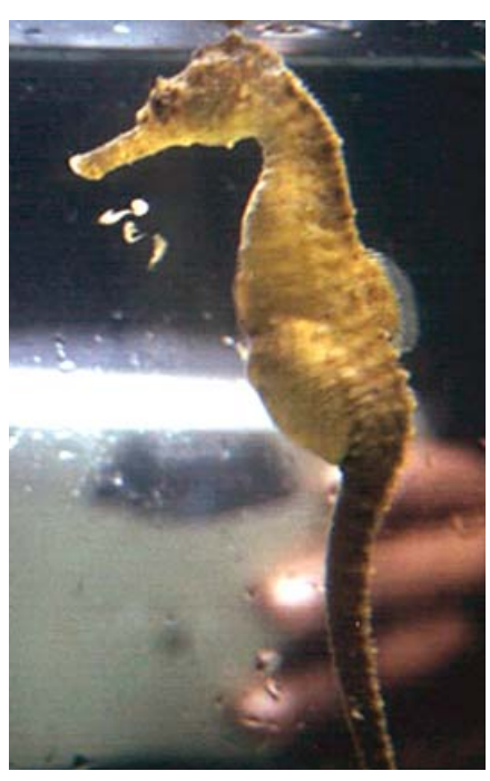
Male seahorses are unusual in that they brood the eggs, which are deposited into their abdominal pouch by the female, and give birth.

All seahorses belong to one genus Hippocampus , in which there are 34 species recognised all over the world (Lourie et al., 1999; Lourie & Ran-