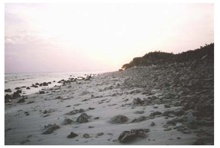
Loss of critical habitat such as coastal reefs is a threat to seahorse populations.

to be associated with seaweeds mainly during the two monsoon periods when the sea became rough and water was turbid. Although there was no organised trade in Kerala, the local fishermen ascribed some medicinal uses for seahorses, which were dried, powdered, and mixed with honey as a local remedy for asthma. It was also believed by many fishermen that seahorses could prevent epilepsy or other similar disorders, if kept attached to the body as a talisman.