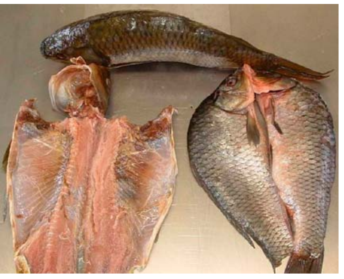
Fillets of Common Carp.