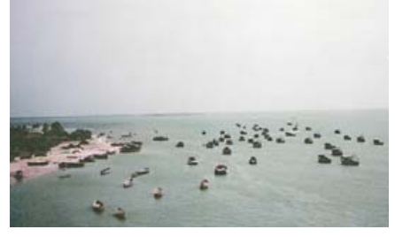
Fishing crafts bringing by-catch of seahorses in Gulf of Mannar coast of India.

Vincent (1996) reported the trade volume from India to be about 3.6 metric tonnes (1.5 million individuals) of dried seahorses per annum in 1995 while Salin et al. (2005) estimated the Indian seahorse trade to be 9.75 metric tonnes (2.65 million individuals) in 2001. Most of the catch was dried and exported to Singapore, Hong Kong and Malaysia in addition to some limited local consumption in folk medicine for treatment of asthma, fits and other illnesses. According to official estimates (Anon, 2003), about 2.53 metric tonnes of seahorses worth 1.5 million Rupees (US$ 40,000) were exported from India during 2000-01, mainly to Singapore, UAE and Hong Kong. This increased to 4.34 metric tonnes during 2001-02, worth 2.673 million Rupees (US$ 70 000), Chennai being the major port of activity. Apparently, the United Arab Emirates is only a transit point and most of the Indian exports are destined for Singapore or Hong Kong, countries with a sizeable population of ethnic Chinese communities.