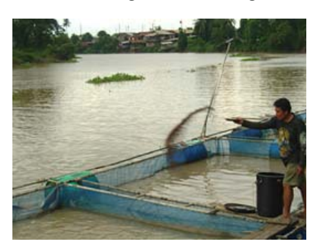
Feeding time, Bang Pa Kong River, Ban Sang, Prachinburi Province.

The uptake of cage culture has been rapid, with promotion by word of mouth following establishment of demonstration farms by feed dealerships, and most production occurs in localized clusters. Although the cost of cages and