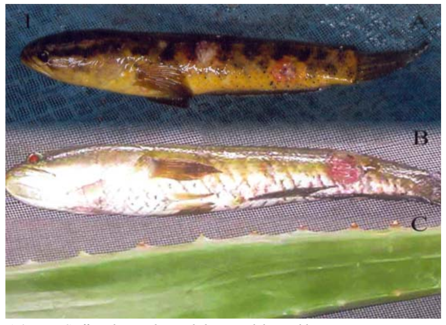
A & B: EUS affected spotted murrel showing abdominal lesions. C: Medicinal herb Aloe vera.

When compared to aloe paste, neem paste was more effective. In the case of